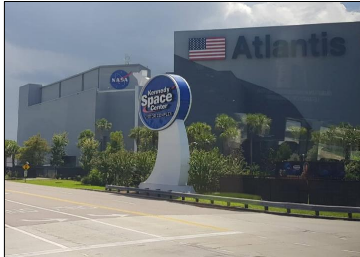
Kennedy Space Center

to see a few documentaries and speeches, which gave us a deeper insight into the importance of this part of our history. Especially, an important part of the Kennedy Space Center was McNair Memorial Park, which was dedicated to astronaut Ronald McNair. While we were leaving the camp, we were overfilled with joy and many impressions.