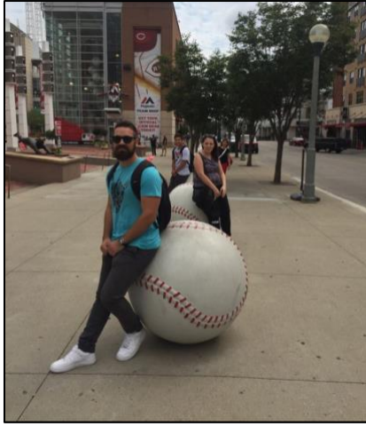
Great American Ball Park