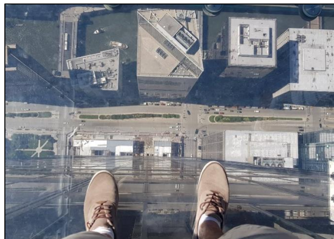
The view from Willis Tower

As the formal part of our visit was over, we used this day to learn about local culture and landmarks. We first decided to visit Navy Pier, but we only had a small amount of time to spend there. Still, we managed to ride The Centennial Wheel, which gave us an amazing view of the coastal part of Chicago. Afterwards, we visited the downtown and Willis Tower, the tallest building in the western hemisphere. We concluded the day by visiting United Center, the arena of Chicago Bulls and Chicago Blackhawks. This was a special experience for me, because I had an opportunity to take a picture with the statue of Michael Jordan.