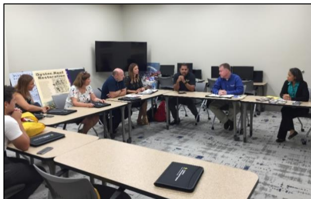
A meeting at UCF

This day began with our visit to University of Central Florida (UCF) campus. At the beginning of our visit we had several meetings during which many discussions were started about the collaboration between FOI and UCF. It was very interesting to hear many different ideas about the new ways of collaboration. After the meetings, we visited some of the most important buildings in the campus. The day ended with our visit to Disney World, the largest Disney park in the world.