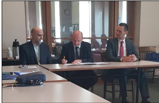
The symbolic signing of the agreement