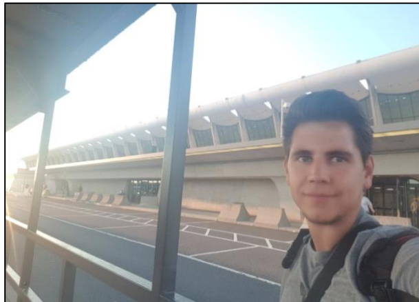
Dulles International Airport

This story begins with me travelling on a plane for the first time ever, so it was understandable why I had a certain amount of fear and tension. But to my surprise, I found all of the flights very comfortable, due to the professionalism and kindness of the United Airlines aircrew. Unfortunately, everything did not go smoothly ... as our flight to Cincinnati was canceled due to routine maintenance; which resulted in spending the night at the Hilton hotel on the airlines expense.