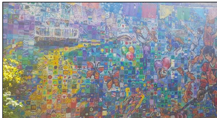
Street art at Pilsen