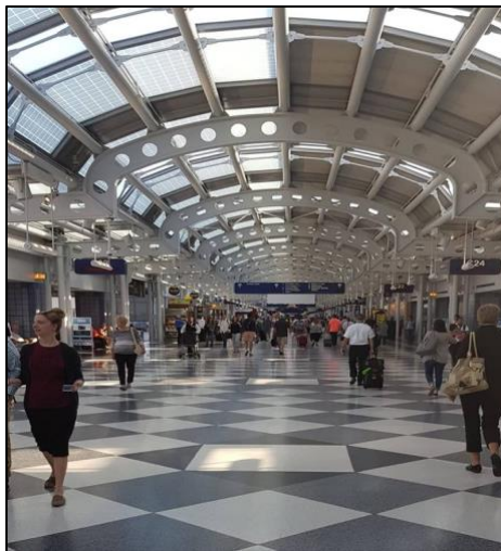
Chicago O'Hare International Airport