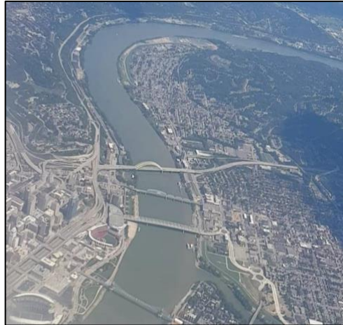
Cincinnati iz zraka