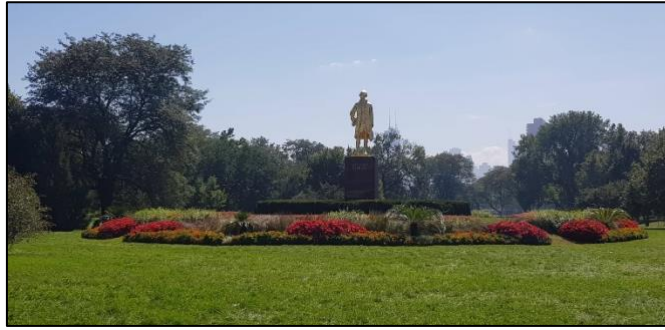
Statue of Alexander Hamilton